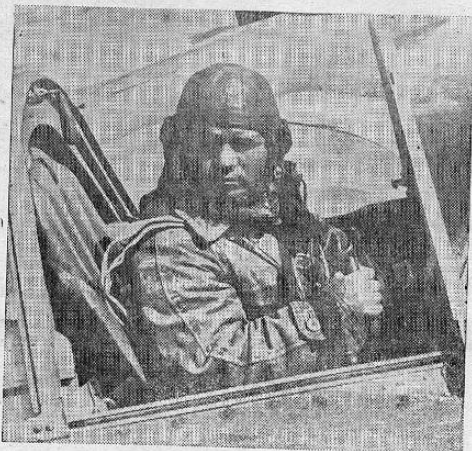
Captain Vyaznikov of the Soviet Air Force, pilots a bomber and with the crew of his plane, in one single combat, brought down four German planes.