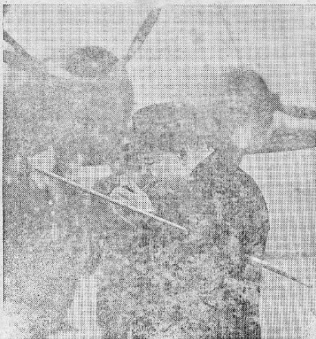
Pausing for a moment to light his cigar, the British Prime Minister, Mr. Winston Churchill, inspected British and some of the many American bombers which are being flown across the Atlantic to Britain in ever-increasing numbers. He was accompanied by the United States Ambassador-at-large, Mr. Henry Hopkins.

The Central American Express extends its condolence.