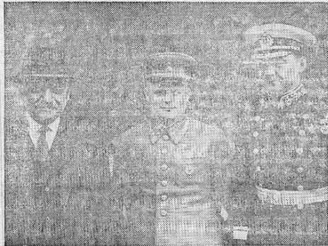
Heads of the Russian Army, Navy and Air Force photographed as they arrived in London to collaborate with Britain in the war against the German invader.