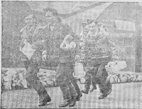
This photograph was taken by an Ulster lough now as an operational base for giant Catalina flying-boats, a focal point in the air battle of the Atlantic.

It shows the "strike" crew rushing out on receiving an urgent call. The crew, who stand by in full kit, complete with rations, have to be ready to take off at a moment's notice.